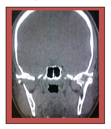
Fig. 5. Coronal CT of case 2 showing sagittal fracture of Lt condyle.